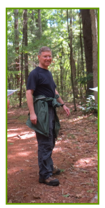
Salem Town Forest