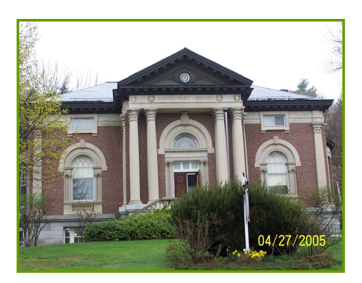
Wilton Public & Gregg Free Library