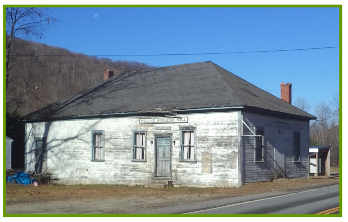
Willing Workers Hall, Warren