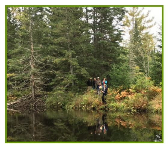
Ammonoosuc River Forest, Bethlehem