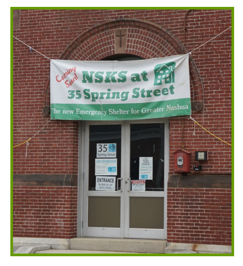
Nashua Soup Kitchen and Shelter