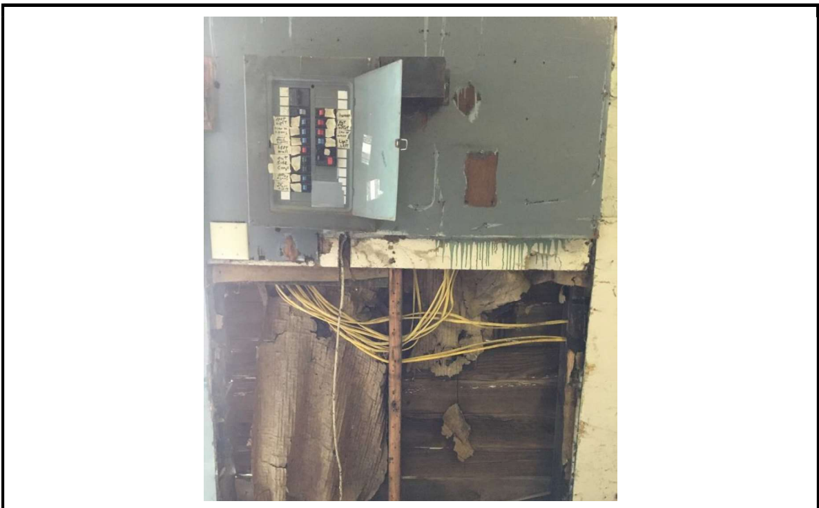
Figure 4: Inside of Sidewall