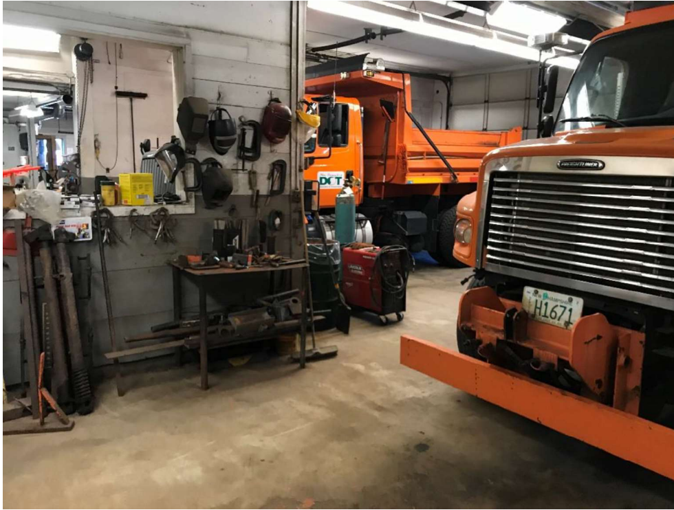
PS510 Milford Interior View of Bays for 2 State Trucks with no plow equipment