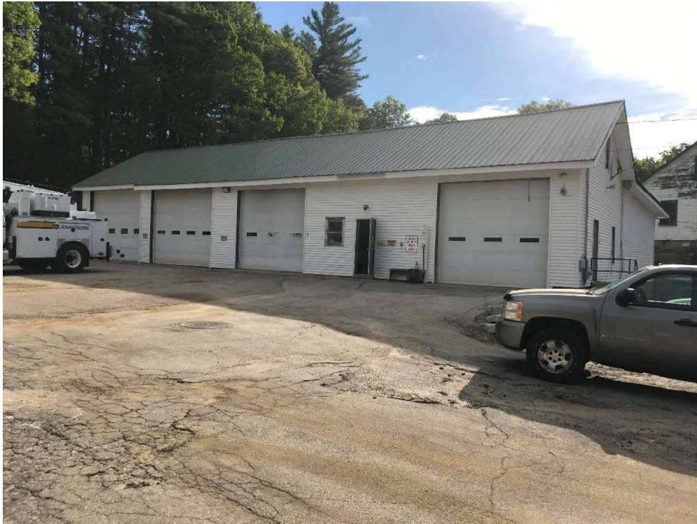
PS510 Milford Perspective View Looking North East