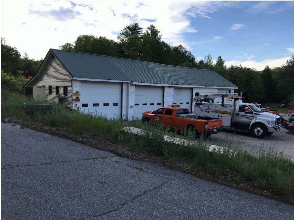
PS510 Milford View Looking South East