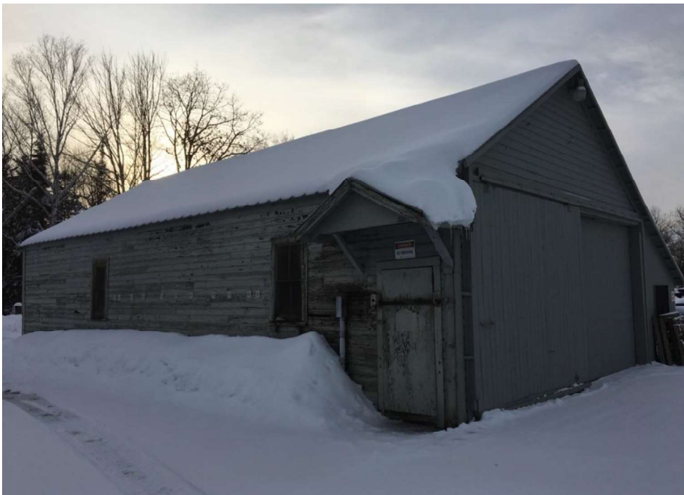
Figure 2: Sidewall in Poor Shape