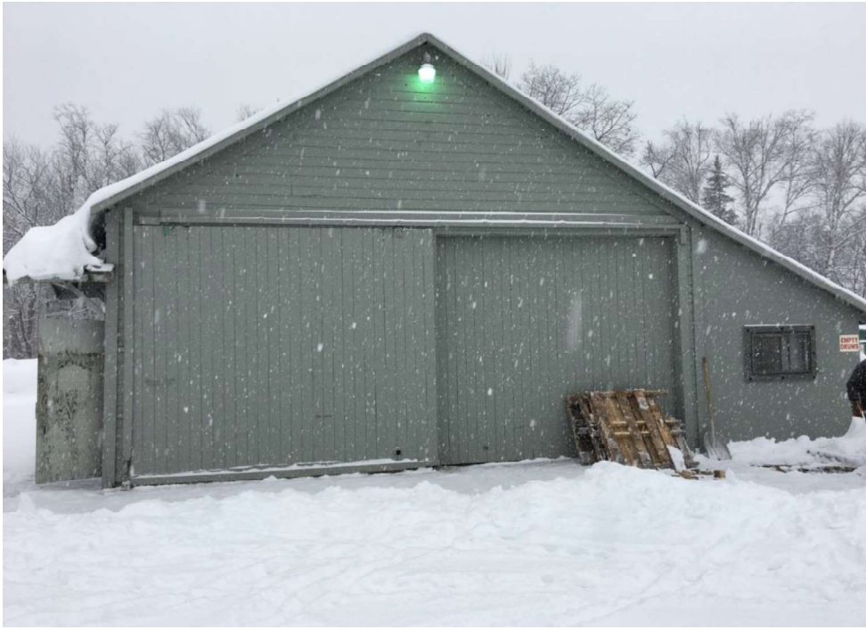
Figure 1: Front View of Building