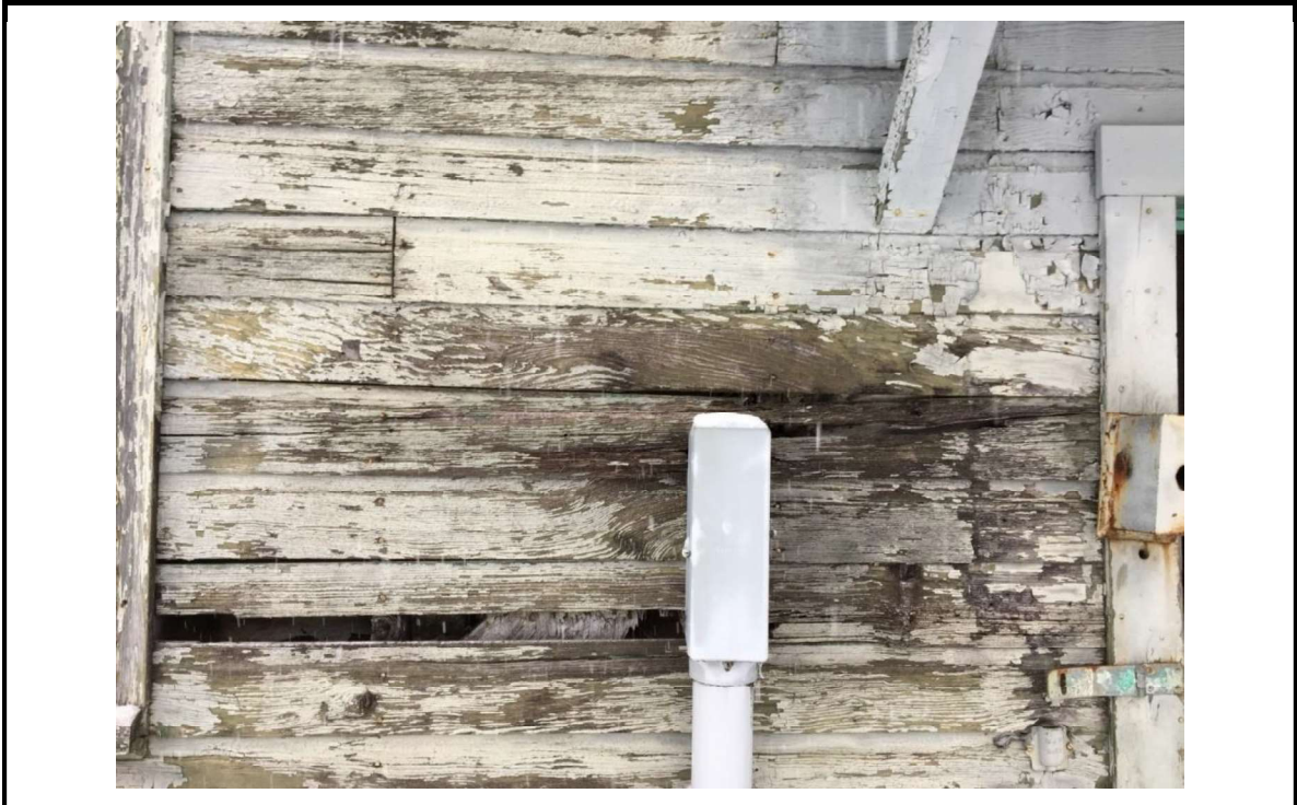
Figure 3: Close up of Sidewall (Exterior)