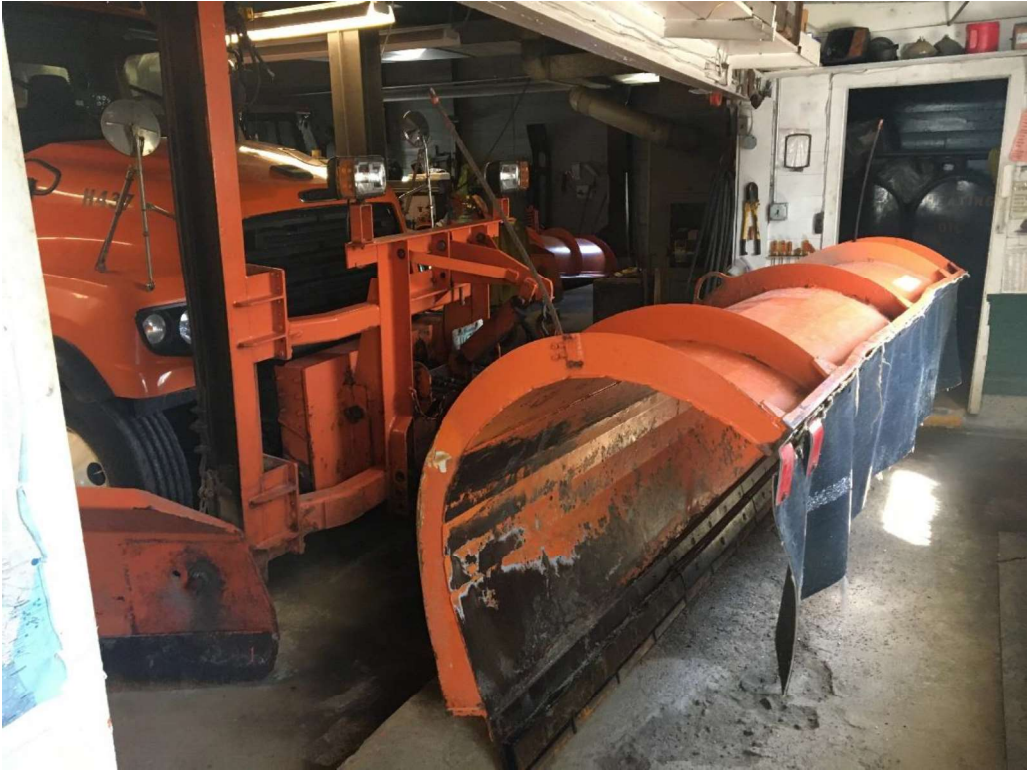
Photo-3: View of the front of truck with plow equipment mounted and parked in shed. Minimal clearances and uneven surfaces throughout the building make it difficult to navigate and increase risk of accidents and injuries.