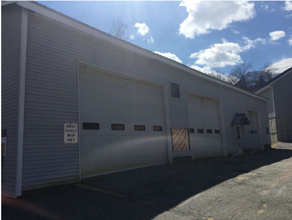
Photo-1: Front view of existing patrol shed. Garage doors are in need of replacement and are undersized to safely accommodate the vehicles and equipment.