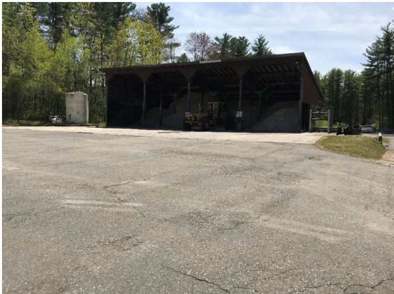
PS512 Londonderry Salt Shed