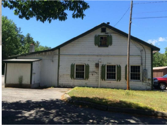
PS512 Londonderry Perspective View Looking East and West