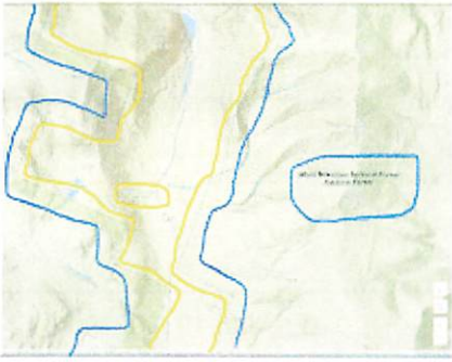
little haystack boundary map annotated.JPG 187K