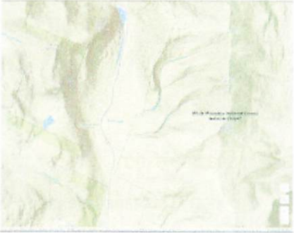
little haystack boundary map.JPG 127K