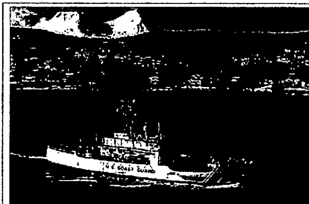
The USCGC Storis (WMEC-38), over a month after decommissioning.

During her first years, STORIS operated in the very waters from which her name was derived. "Storis" is a Scandinavian name taken from the Eskimo word "sirorssuit" meaning "great ice."